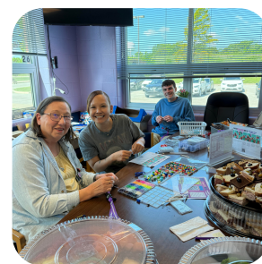
Staff at the IC craft lanyards during Staff Appreciation Week.