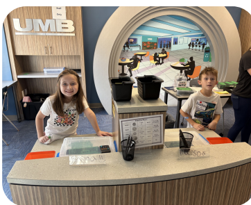
Third graders visit the School of Economics, which was partially funded by PTO.